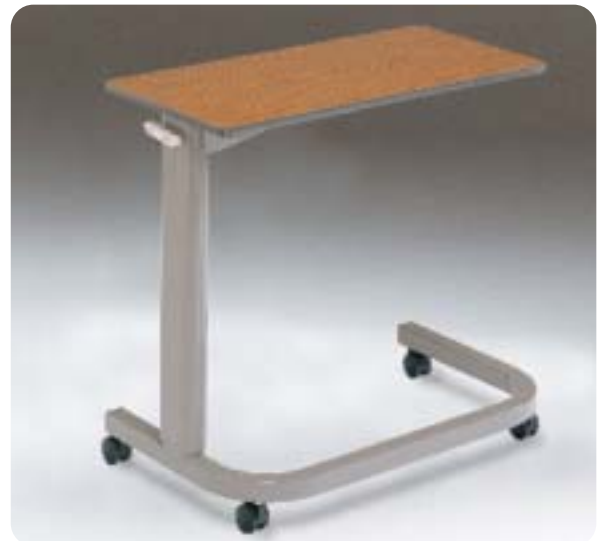
C-base Overbed Table