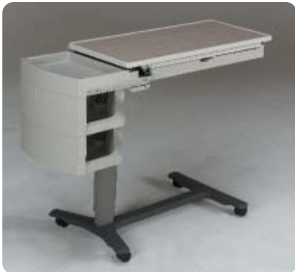
PatientMate® Overbed Table with storage compartment Available with Standard or Low Base