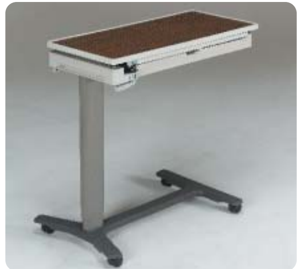
PatientMate® Jr. Overbed Table Available with Standard or Low Base