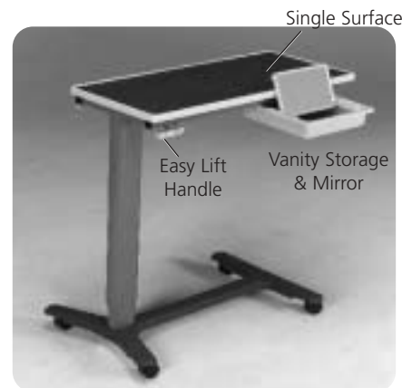
Standard Overbed Table