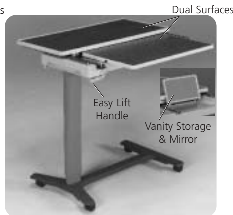
PatientMate® Jr. Overbed Table