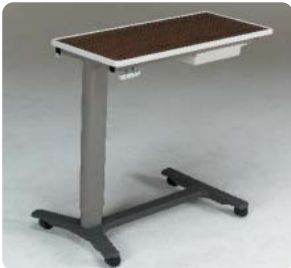
Standard Overbed Table Available with Standard or Low Base