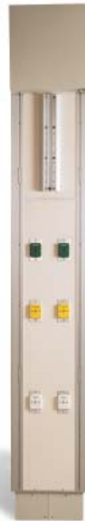
Small Power Column Front View