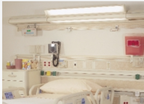
Integris® Patient Light with Lite Rail (P2003B)