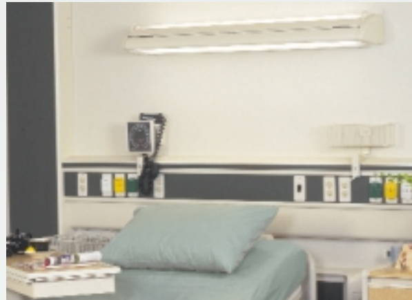
Integris® Patient Light (P696IL)