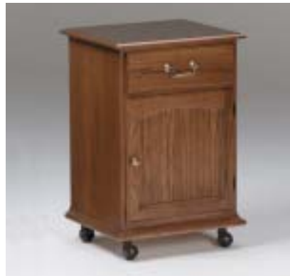
FreedomHill™ Door / Drawer Bedside Cabinet (FDH-120)