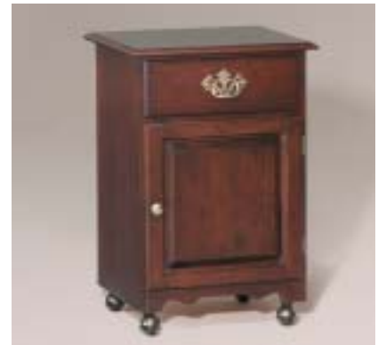
LibertyHill™ Door / Drawer Bedside Cabinet (LBH-120)