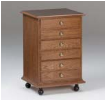
FreedomHill™ 3 Drawer Bedside Cabinet (FDH-100)