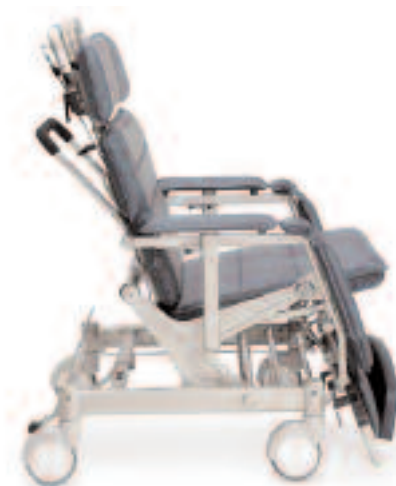
Barton Transfer Chair