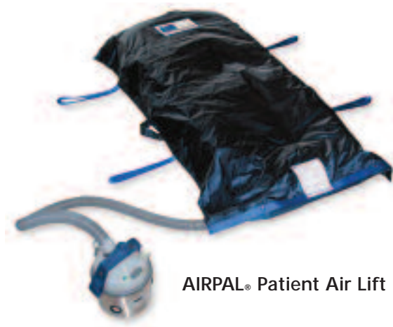
AIRPAL® Patient Air Lift