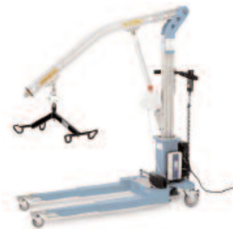
LIFTEM® MARK IV Portable Lift